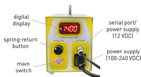
Operation and display elements of ATM 228.