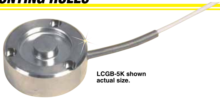
LCGB-5K shown actual size.

The LCGB Series comprises miniature low-profile compression load cells with excellent long-term stability. An all stainless steel construction ensures reliability in harsh industrial environments. These cells are designed to be mounted on a flat surface using cap screws to secure them to the base. A load button is integral to their basic construction for even force distribution.